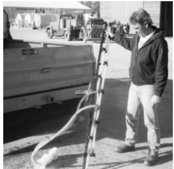
Jefferson County built its own double spray bar to apply mag chloride to bridge decks.

equipment. In cooperation with Monroe Truck Equipment, they are investigating improved spreader controls, on-board pre-wetting and anti-icing equipment. They are also working on ways to reduce blowing snow around snow plows (the so-called white cloud effect), and to improve safety through lighting equipment and improving driver safety.