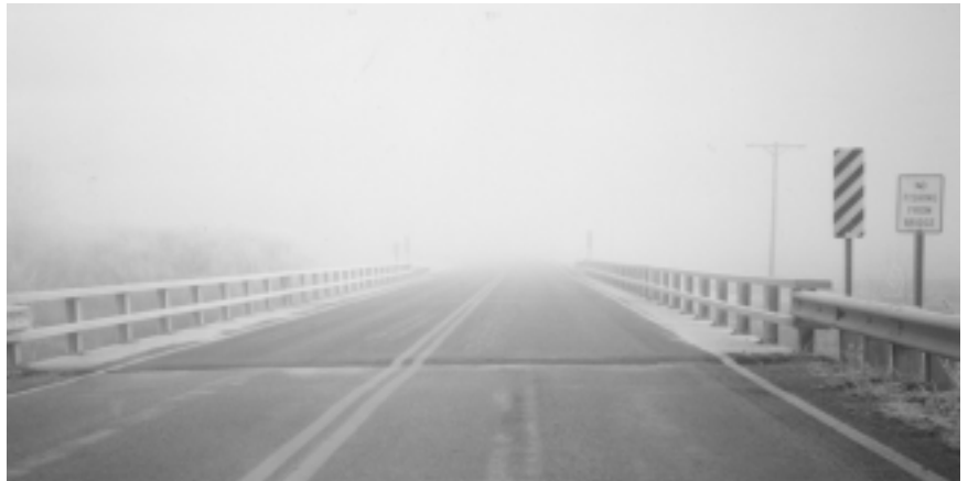
Icing on bridge decks is a frequent problem. Spraying liquid magnesium chloride can help prevent it.

WisDOT is also working with several counties on developing a winter maintenance "concept vehicle" to test new snow removal